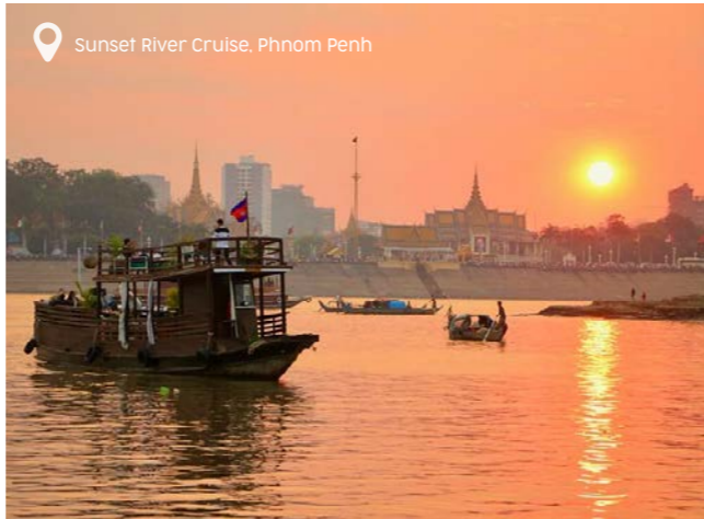
Sunset River Cruise, Phnom Penh