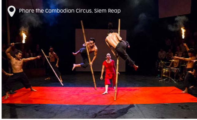
Phare the Cambodian Circus, Siem Reap