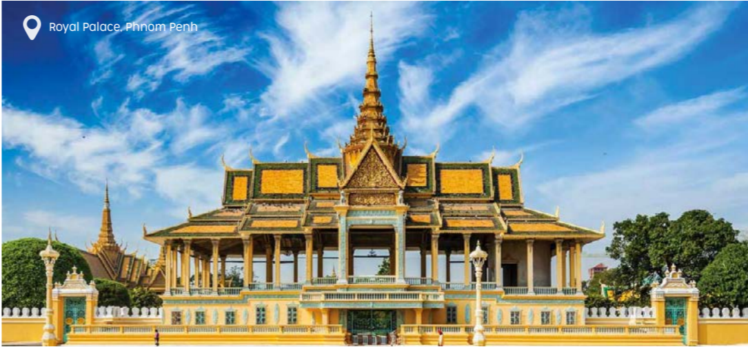
Royal Palace, Phnom Penh