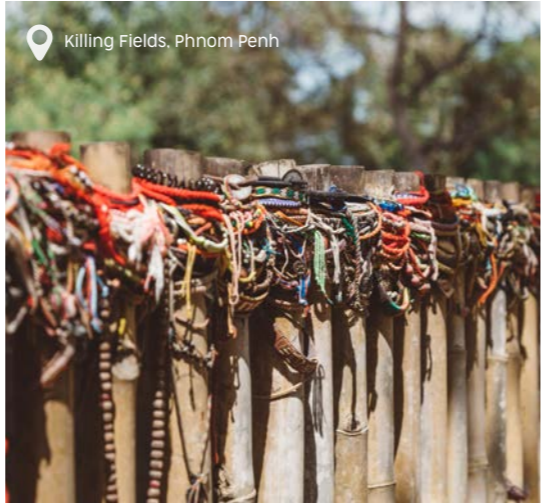
Killing Fields, Phnom Penh