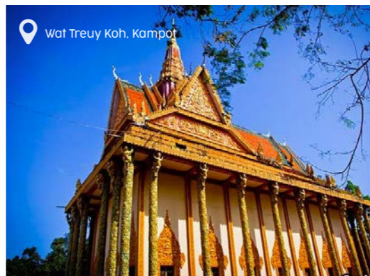
Wat Treuy Koh, Kampot