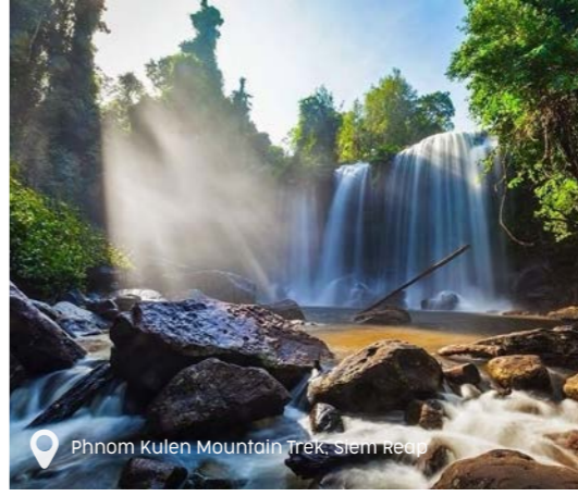
Phnom Kulen Mountain Trek, Siem Reap