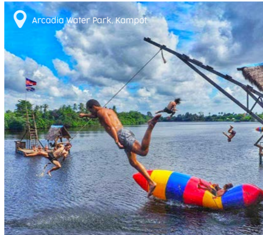
Arcadia Water Park, Kampot