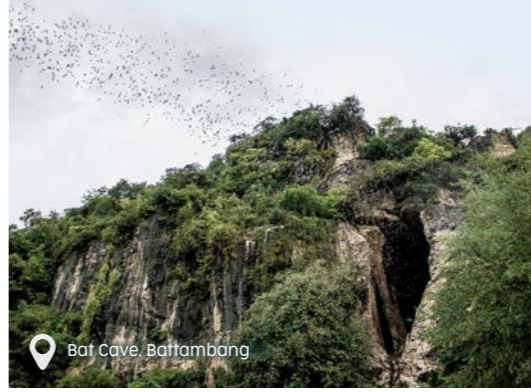
Bat Cave, Battambang