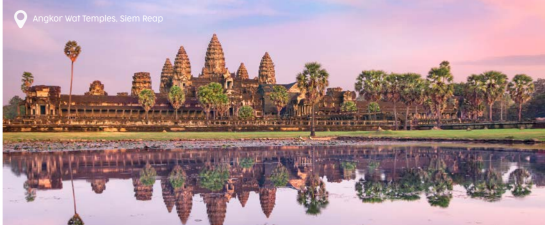
Angkor Wat Temples, Siem Reap

Freestyle Tour: Top-rated activities are included and if you want to opt for extra activities, your Guide can provide recommendations and assist with booking.