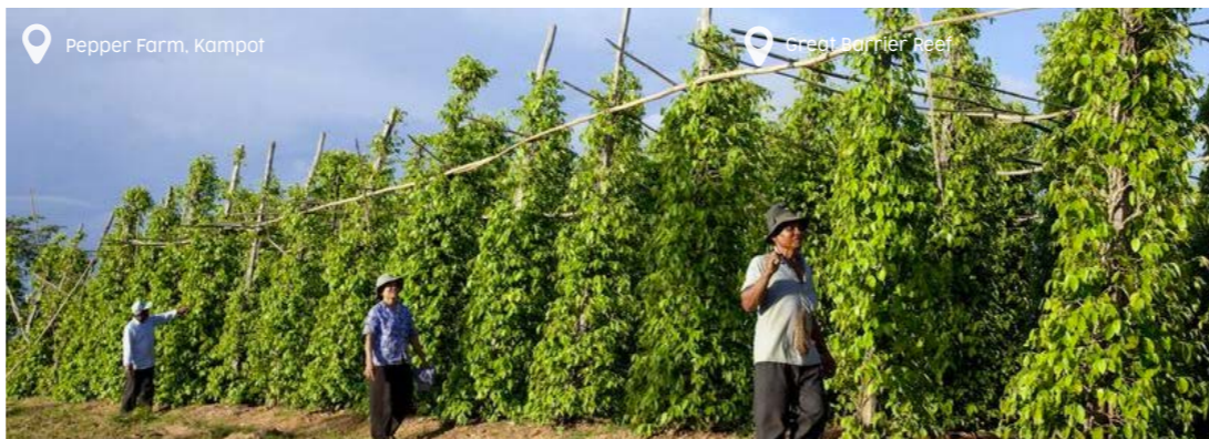
Pepper Farm, Kampot