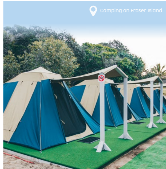
Camping on Fraser Island