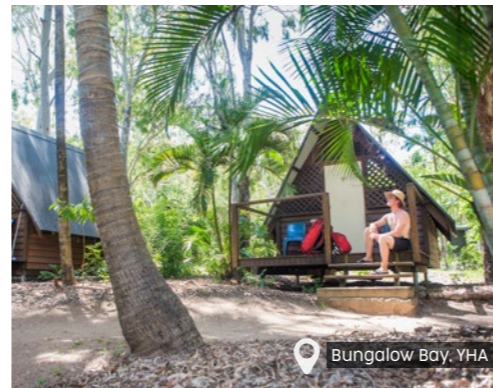
Bungalow Bay, YHA