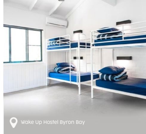
Wake Up Hostel Byron Bay

If you choose to hop off and extend your stay, you'll need to book additional nights' accommodation via the StRay Mate app.