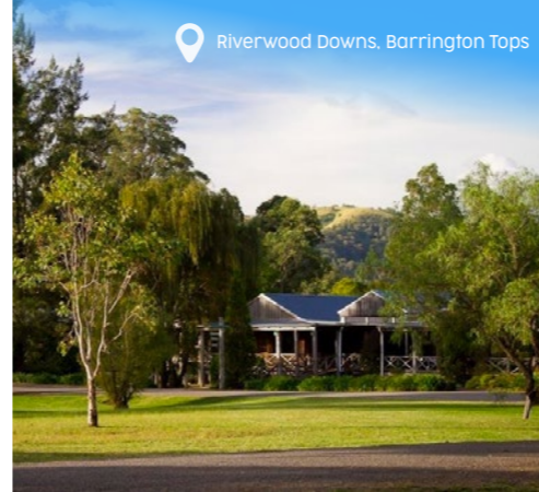
Riverwood Downs, Barrington Tops