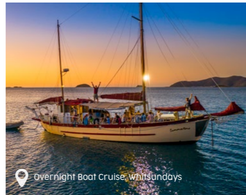
Overnight Boat Cruise, Whitsundays