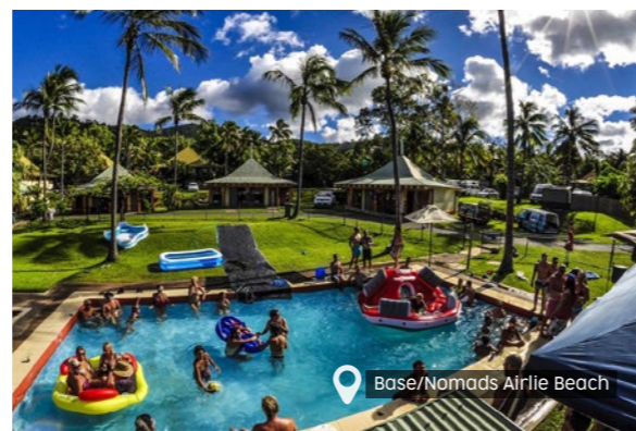
Base/Nomads Airlie Beach