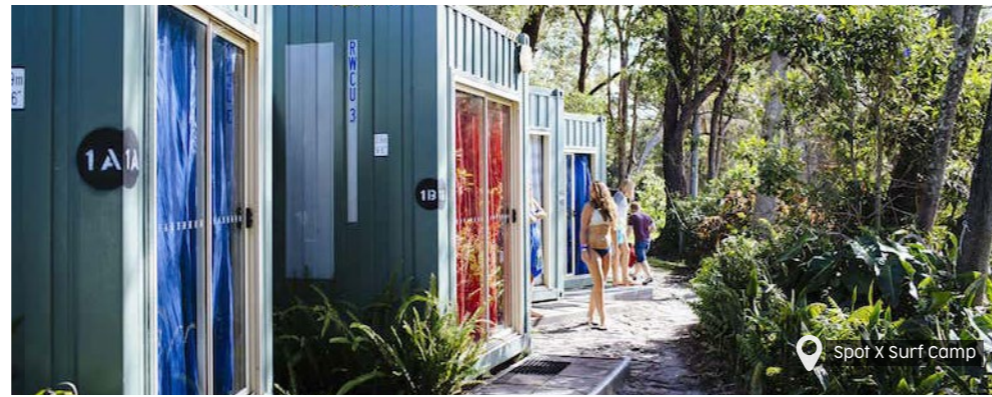
Spot X Surf Camp