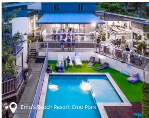
Emu's Beach Resort, Emu Park