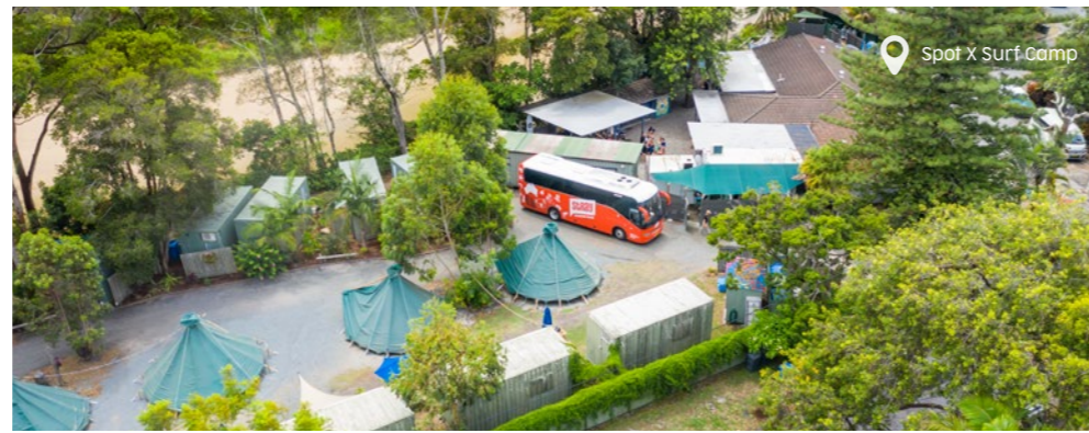
Spot X Surf Camp