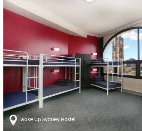
Wake Up Sydney Hostel

Please note: Single sex accommodation is not guaranteed. In peak season (Nov - March) twin and double rooms may have limited availability.