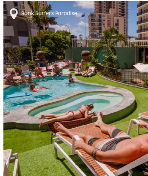
Bunk Surfers Paradise