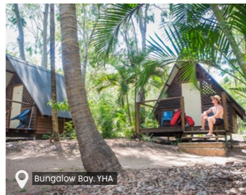
Bungalow Bay, YHA