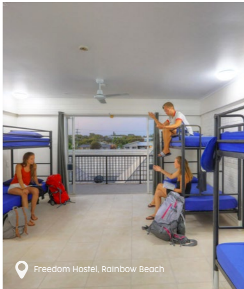
Freedom Hostel, Rainbow Beach