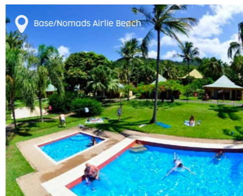
Base/Nomads Airlie Beach